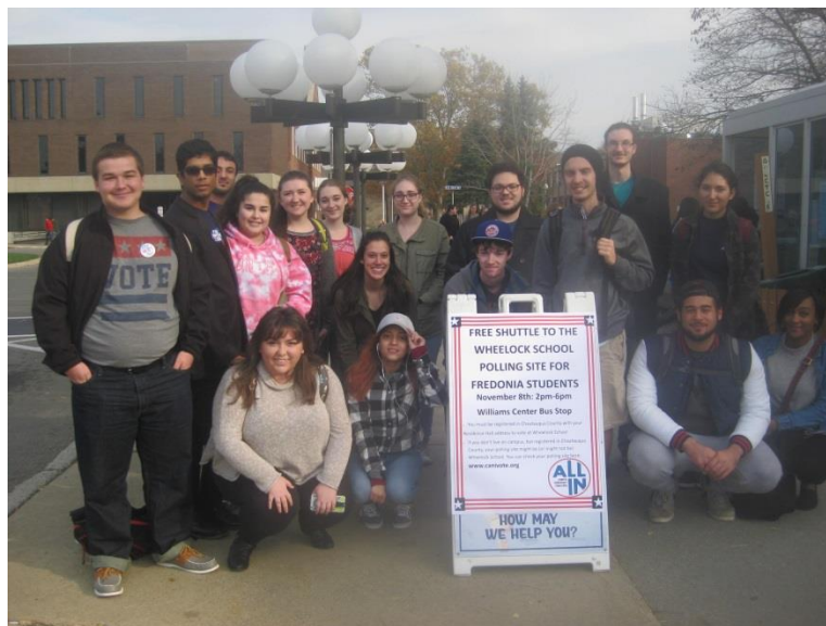
First group of students waiting for the "Campus Voting Bus" to take them to the polls!

The ALL IN Committee worked with the University Services office to arrange for a bus and drive to take students to and from the voting polls. Since very few on-campus students have vehicles, this was greatly appreciated by the students and one more way for students to interact and discuss the whole election process!